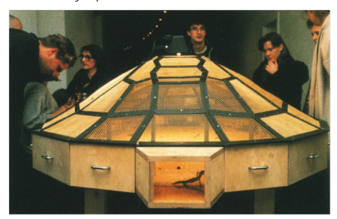
Figure 7 - Huang Yong Ping. Theater of the Word. 1993. Wood, metal, warming lamps, electric cable, insects, lizards, snakes, and toads.

Prior to the removal of several works from the Guggenheim's current exhibition Art and China after 1989: Theater of the World , there were a few particular works which echoed the concepts of using animals as a stand-in for the human condition. Theater of the World by Huang Yong Ping (1993, Figure 7) was intended to be shown with "a wood, steel, and mesh structure inhabited by reptiles and insects that will eat each