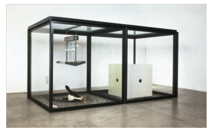
Figure 3 - Hirst, Damien. A Thousand Years. 1990. Glass, steel, silicone rubber, painted MDF, Insect-O-Cutor, cow's head, blood, flies, maggots, metal dishes, cotton wool, sugar and water.

of a calf. This compact environment envelopes the inevitable occurrence of death by literally depicting the life-cycle.