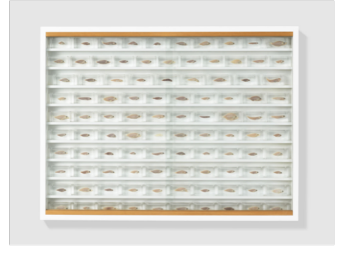
Figure 2- Hirst, Damien. Alone Yet Together. 1993. Glass, painted MDF, ramin, acrylic, fish and formaldehyde.