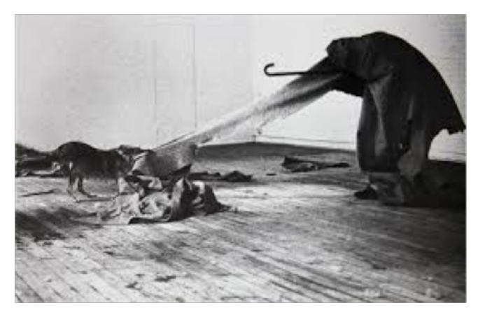
Figure 6 - Beuys, Joseph. I Like America and America Likes Me. 1974.

However, not all modern and contemporary artists handle the physical body of the animal within their work; others use the animal in a form of collaboration in contrast to jurisdiction. For example, modern artist, Joseph Beuys, performed his piece I Like America and America Likes Me (Figure 6) in 1974, where a coyote is an equal participant with Beuys himself. First, it is important to note that Beuys had a long history of employing the body or pieces of deceased animals, where the hare held a prominent role.