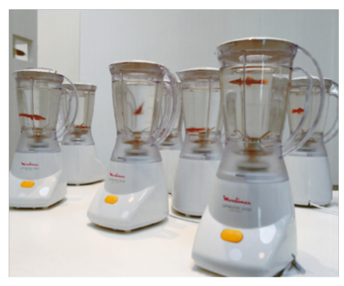
Figure 4 - Evaristti, Marco. Helena . 2000. Electric blenders, goldfish, and power cord.

Marco Evaristti displayed a similar message in a contrary means of exhibition. In his piece Helena (2000, Figure 4), he used live animals. According to Rachel Share, the exhibition "featured live goldfish in blenders and gave visitors the opportunity to liquefy the goldfish simply by